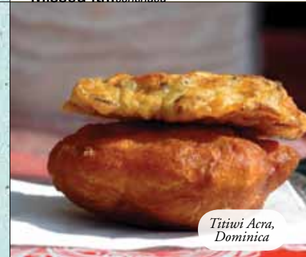
Titiwi Acra, Dominica