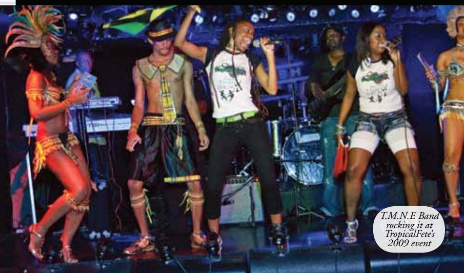
T.M.N.E. Band rocking it at TropicalFete's 2009 event