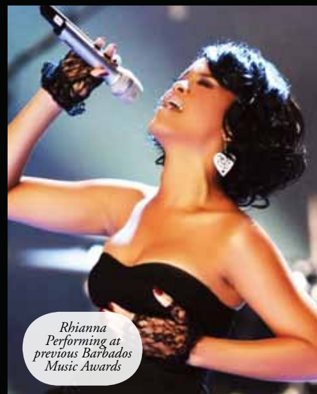
Rihanna Performing at previous Barbados Music Awards

The race courses will be sailed off the waters of Jolly Harbour and Five Islands and will consist of short races. Course description and sailing instructions will be available at registration which will be held on Friday February 12th at the The Foredeck Bar, Jolly Harbour. jhycantigua.com