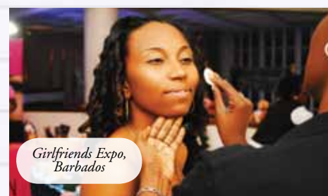
Girlfriends Expo, Barbados