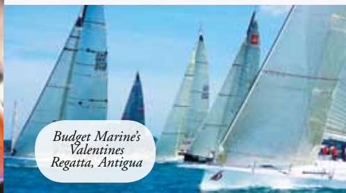
Budget Marine's Valentines Regatta, Antigua

The event also highlighted Breast Cancer awareness and had on the spot HIV/AIDS testing and showcases of the Female Condom - Femidon. It featured other attractions such as an art gallery, treasure hunts, cooking demonstrations, The Imagine Entertainment Kids Zone, The Barbados Today, Speakers Room and The Banks Men Zone. Patrons left Love Fm's Girlfriends Expo feeling empowered, educated and entertained.